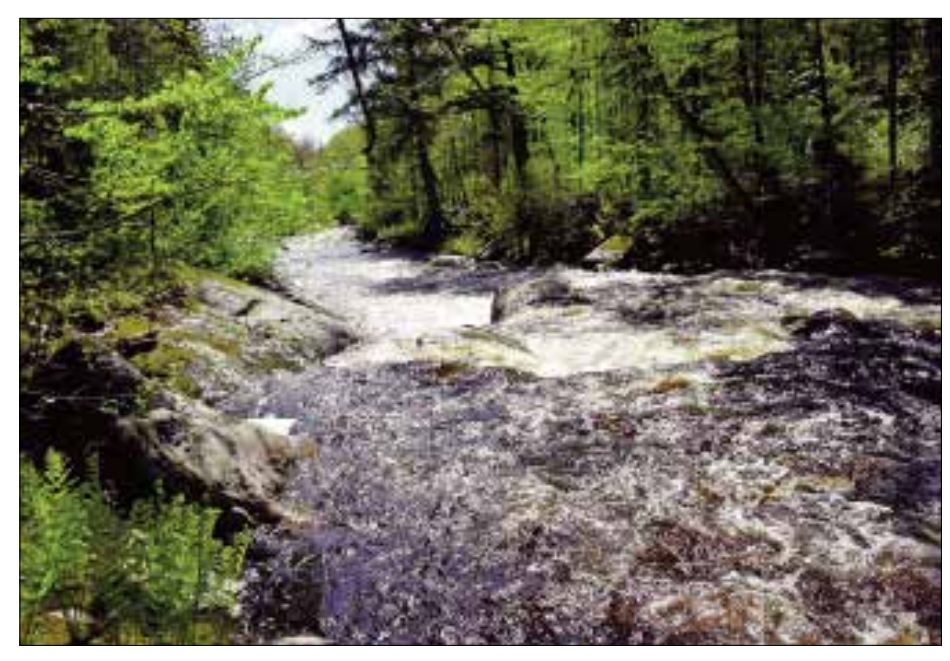
The Humes River Flows fast over its rockyt bed. The Humes River Trail which wanders through the river's watershed is in the Bras d'Or Lakes Biosphere Reserve and is showing great potential for development