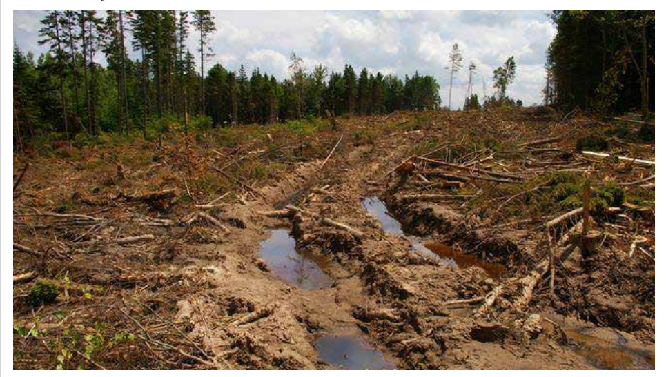
Logging machines tear up this low-lying clear-cut, leaving deep ruts where groundwater collects.