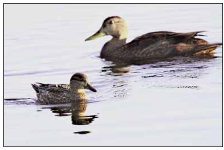
Young American black duck and parent on Bras d'Or Lake.

Now that Cape Breton spring is dribbling in, have you noticed more birds doing more things in more places? April is the time when birds are evident in many habitats of the Bras d'Or Lake Biosphere, arriving back from their winter homes and joining the year-round residents to work on the production of the next generation. In the Mi'kmaw calendar, April is Pnatmuiku's or 'birds laying eggs time' and it is at this time of year that the barrachois ponds of the Bras d'Or lakes play an important role in kick-starting the next generation of many species.